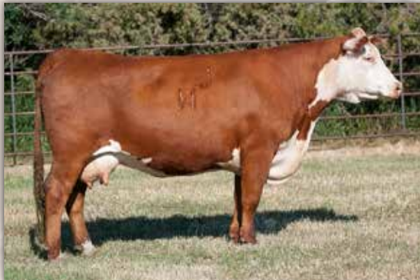
HH MISS ADVANCE 2022Z ET MATERNAL GRAND DAM OF LOTS 103-107

Out of the elite donor 2022Z, 8025F is an extremely long and fancy female that comes from multiple generations of donors that have produced several herd bulls for the Holden program. She excels in carcass and udder quality.