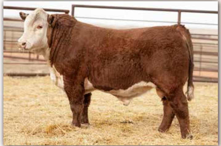
LOT 34 - MH 1056 FORWARD 3222L