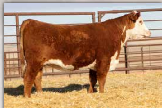
LOT 112 - MH MISS 17J NIGHTCAP 362L

Videos available on our website mrnakherefords.com