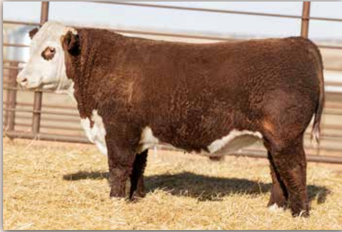
LOT 108 - MH 018 FRESH PRINCE 3726L 1ET