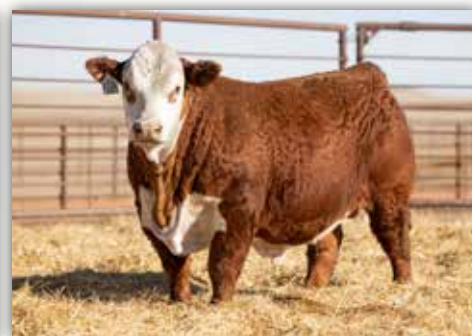
MH 1136J BIG SHOT 3725L 1ET