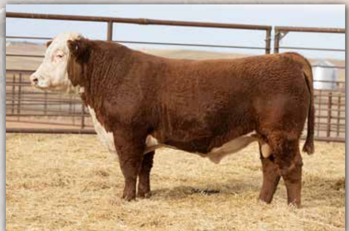
LOT 89 - MH 1242 ADVANCE 381L