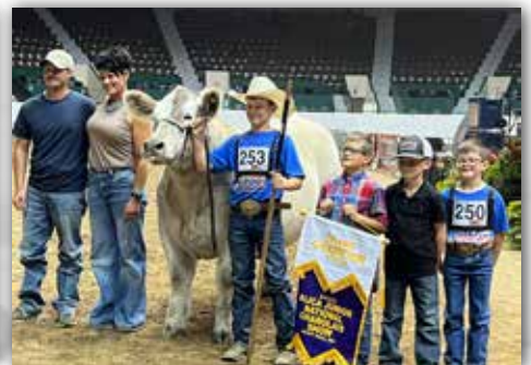
2023 AIJCA Champion Steer