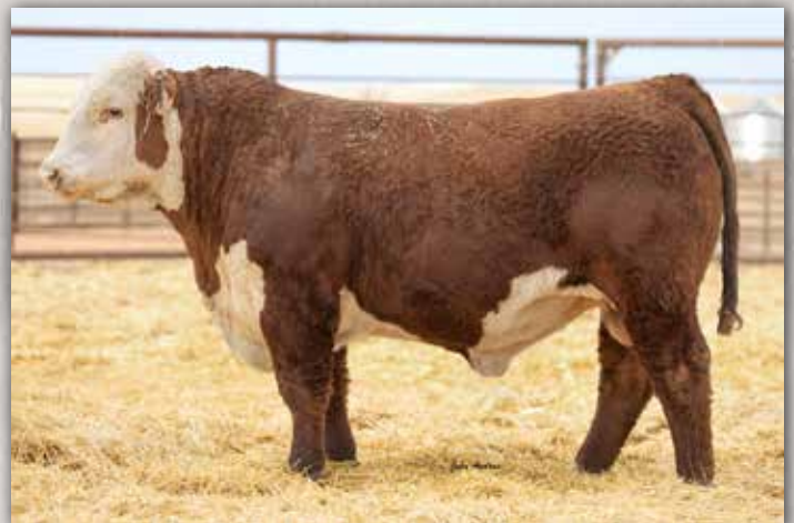
LOT 26 - MH 042 RED TIME 3563L 1ET