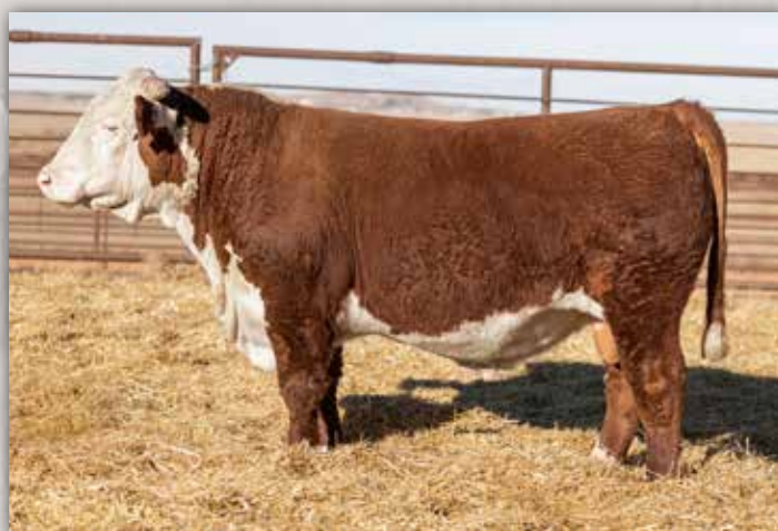
LOT 68 - MH 711 COMET 3254L