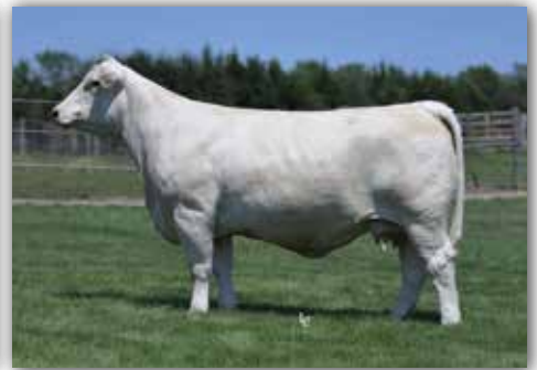
"JASMINE" RBM JASMINE F251