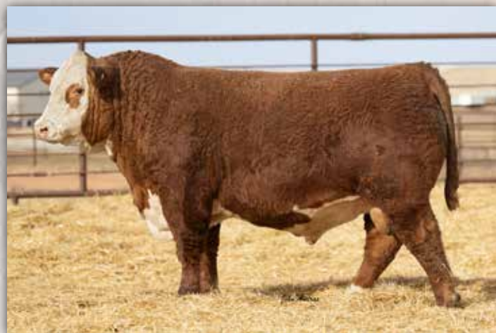
LOT 51 - MH 1056 FORWARD 3283L