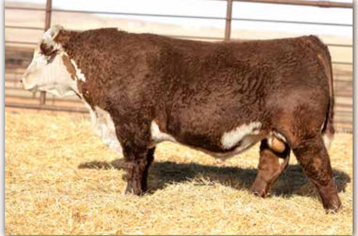
LOT 107 - MH 105H INNOVATION 3711L 1ET

MH 107 MH 105H INNOVATION 3711L 1ET {DLF,HYF,IEF,MSUDF} REG:P44570108 Calved: 9/20/23 Tattoo: 3711