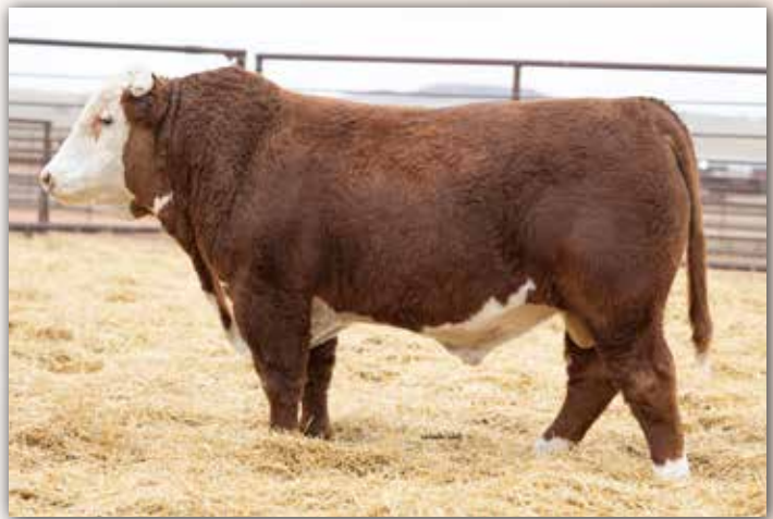
LOT 61 - MH 0504 BRITISHER 341L