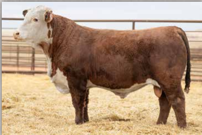
LOT 81 - MH 814F DOMINATOR 3206L