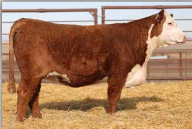
LOT 123 - MH MISS 718F DOMINATOR 3270L