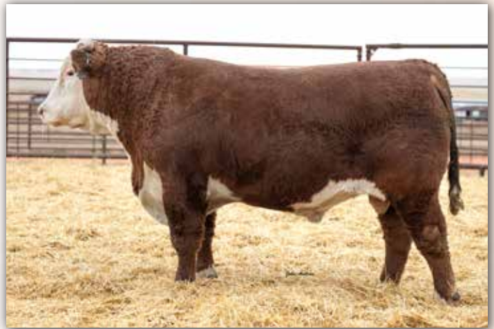
LOT 42 - MH 0510 BRITISHER 364L