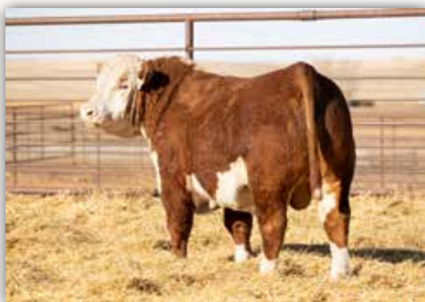
MH TRAVIS 3565L 1ET