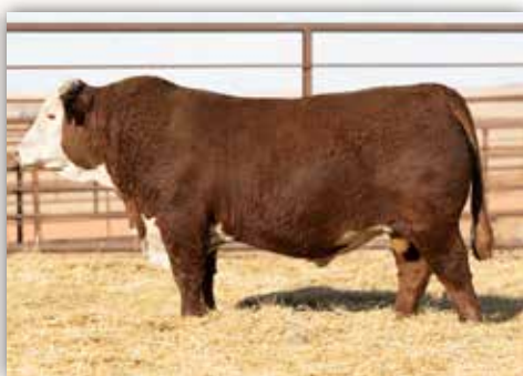
MH 073 RED TIME 320L