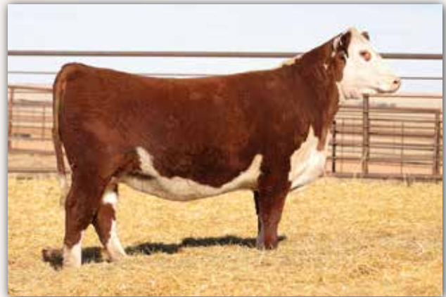
LOT 120 - MH MISS MAKERS MARK 3514L 1 ET

• 3524 is out of the maternal machine Ladysport 42F stemming from the NJW program. Her full brother commanded $72,500 this past spring at Burns Farms in TN. This mating is an outcross we pursued due to the exceptional maternal strength.