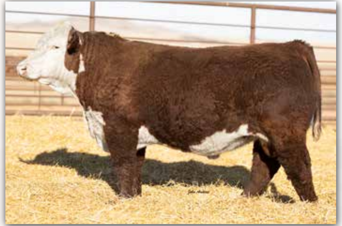
LOT 109 - MH 018 FRESH PRINCE 3731L 1ET