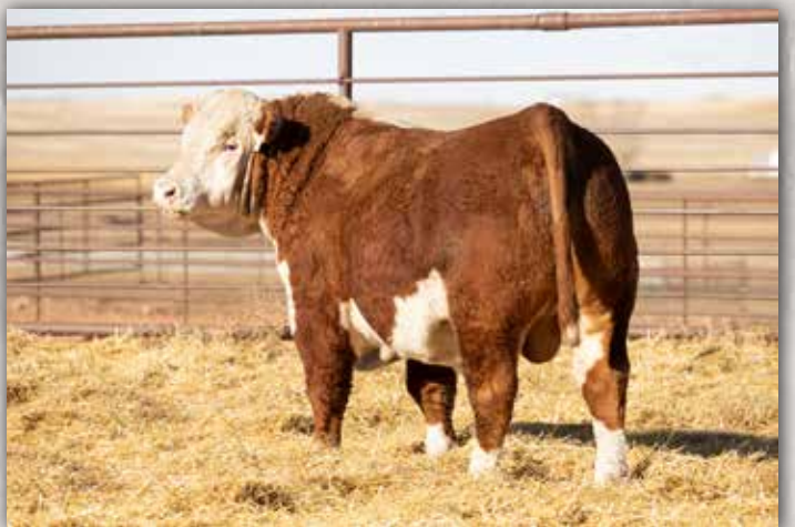
LOT 11 - MH TRAVIS 3565L 1ET