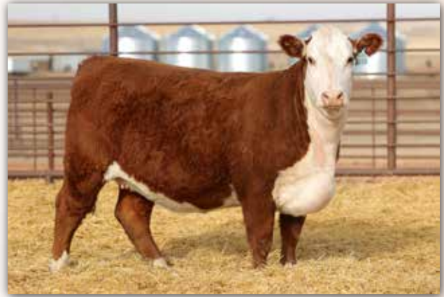
LOT 122 - MH MISS 711 COMET 3236L