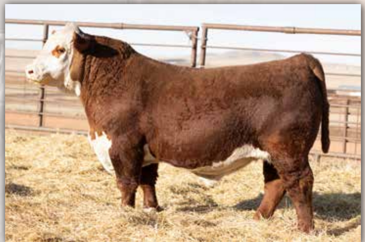
LOT 8 - MH MAKERS MARK 3550 ET

Videos available on our website mrnakherefords.com