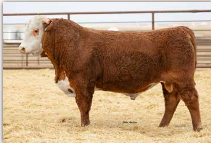
LOT 78 - MH 718 DOMINATOR 3230L