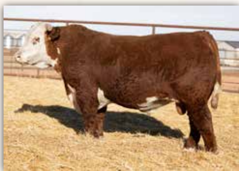
MH 0506 BRITISHER 313L