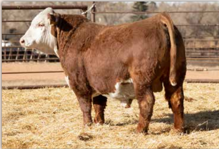
LOT 98 - MH 1136J BIG SHOT 3701L 1ET