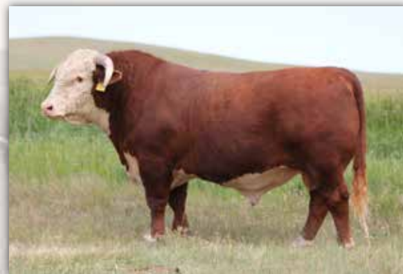
BCC COMET 711E - SIRE OF LOT 1