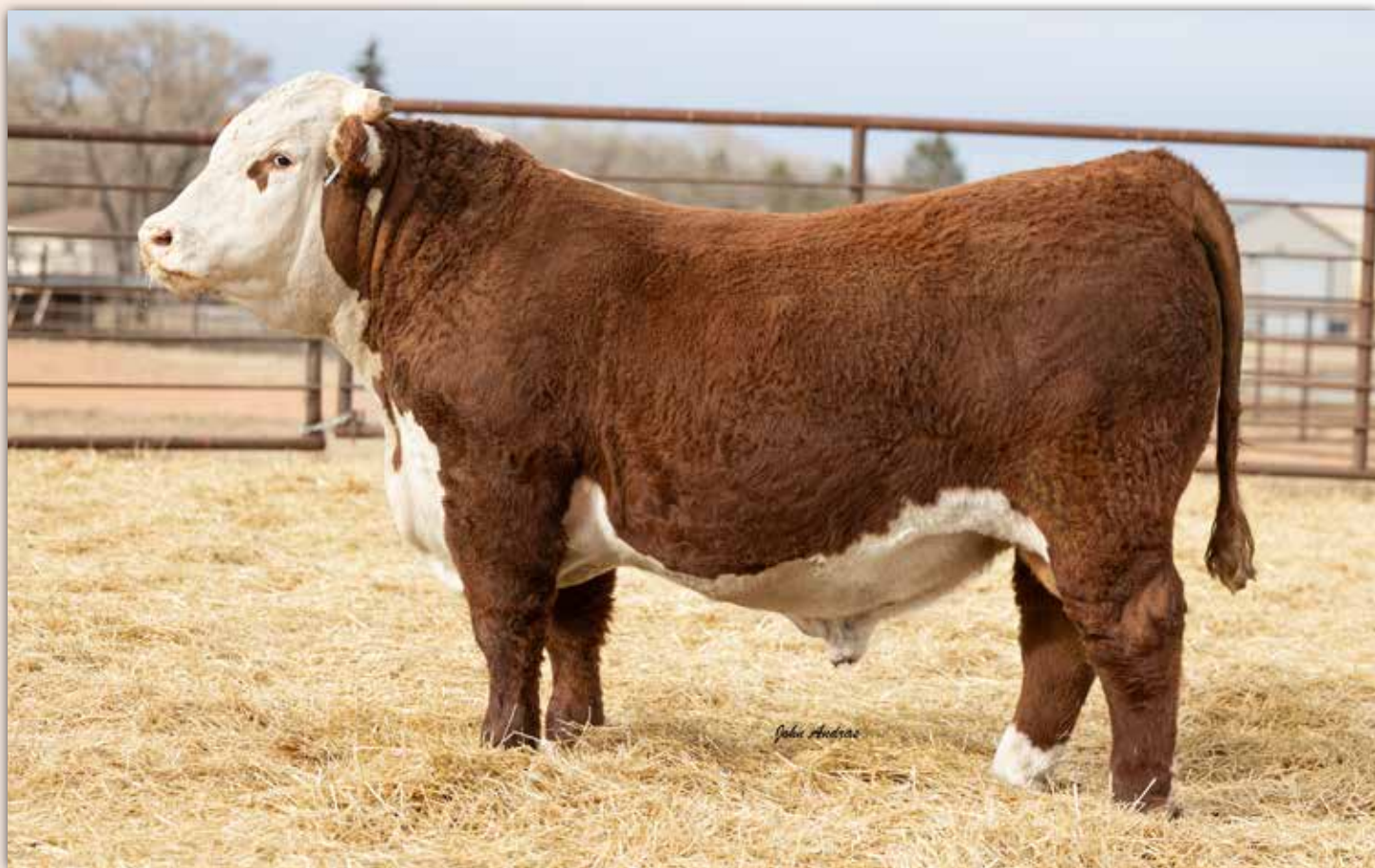
LOT 1 - MH 711 COMET 3126L