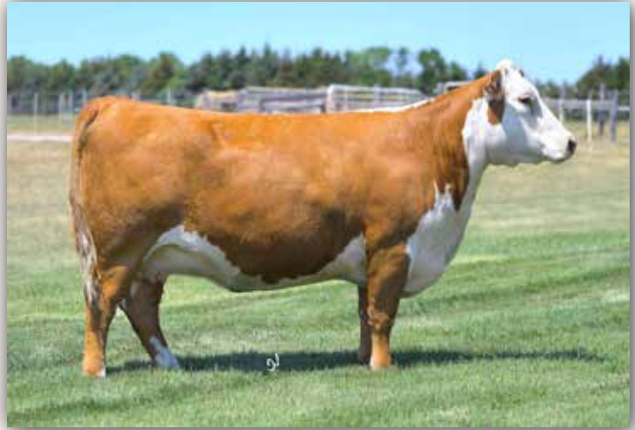
MH MISS REE HEIGHTS 551 1ET

MH Miss Ree Heights 551 has proven to be a "Once in a Generation" female and will continue to plant her roots deeper into our program for years to come. As you will notice, 13 of her sons are in this sale and 11 of them are in the top 20. She is as consistent of a breeder as we have ever produced and she carries power, performance, and style into each of her calves, regardless of the sire that she is paired with. She is a feminine, moderate framed, eye-catching female that has produced over 60 top producing offspring including 25 females that are currently in production at the Mrnak Ranch. We can't say enough about the consistency of this top Donor Cow and we are confident in the quality of calves that her sons will produce for you.