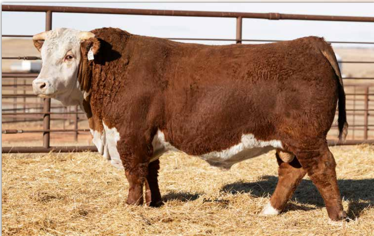
LOT 2 - MH 1056 FORWARD 379L