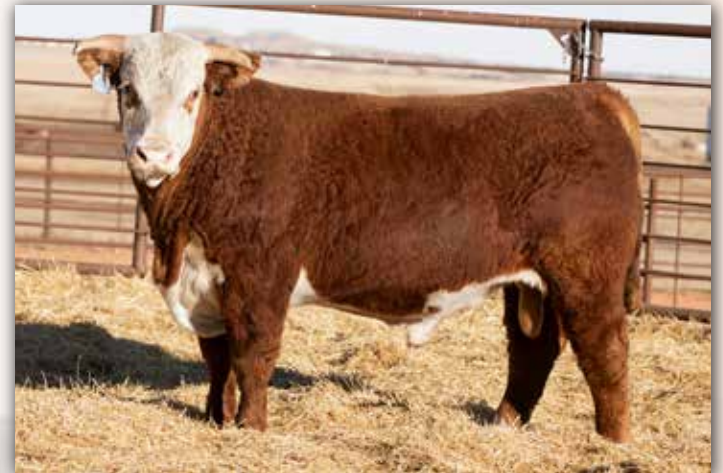
LOT 43 - MH 250 BEEFMAKER 3193L