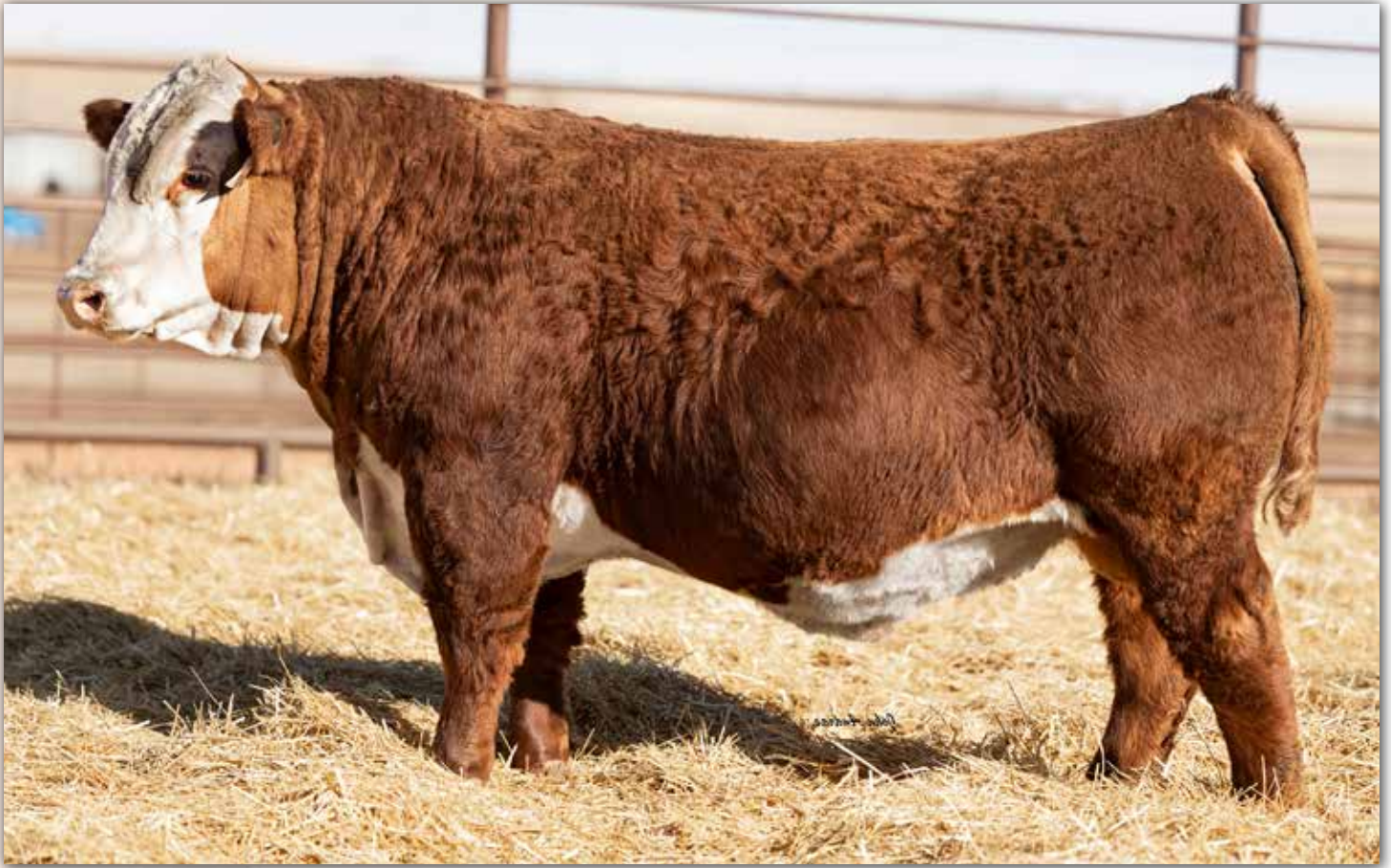
LOT 96 - MH 1136J BIG SHOT 3715L 1ET