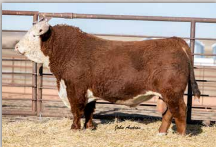
SR DS DOMINATOR 718F

We had the opportunity to acquire not only 1056J but, his full sister 1144J who is featured on our donor page. These full siblings were purchased with Pelton Herefords of ND. We were very intrigued by the proven horned and polled pedigrees of this mating along with the extremely strong maternal characteristics coupled with the volume, rib shape, and muscle that both of these possess. They are both breeding and raising true to their design and EPD profile and these genetics will have a big impact in our program for years to come. 6 sons and 3 bred heifers sell.