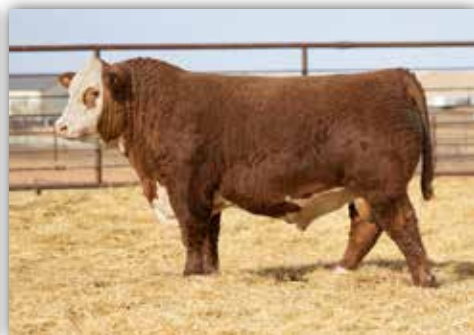
MH 1056 FORWARD 3283L