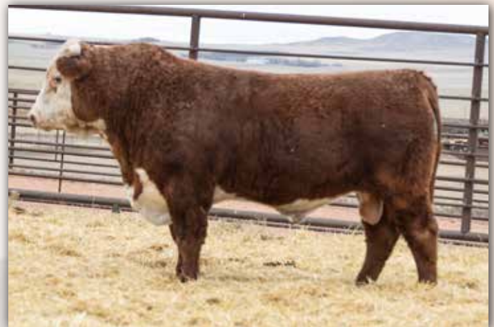
LOT 72 - MH 0510 BRITISHER 0510L