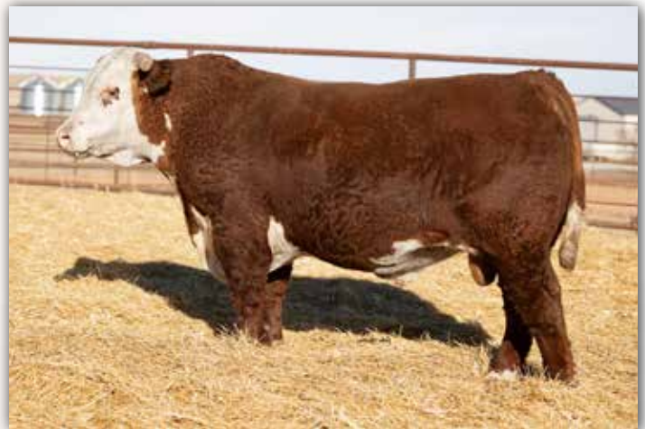
LOT 3 - MH 0506 BRITISHER 313L