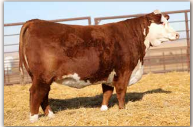
LOT 116 - MH MISS 824 DOMINATOR 3111L