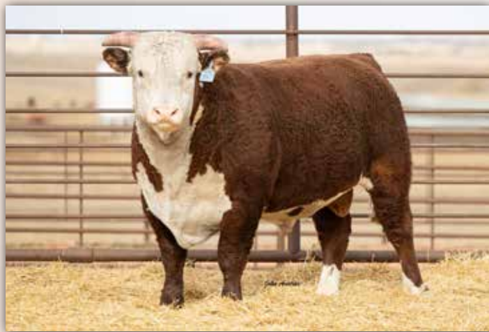
LOT 76 - MH 211 VAUNTED 347L