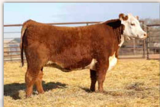
LOT 110 - MH MISS 1056 FORWARD 3600L 1ET