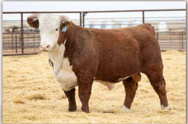
LOT 13 - MH 711 COMET 3165L