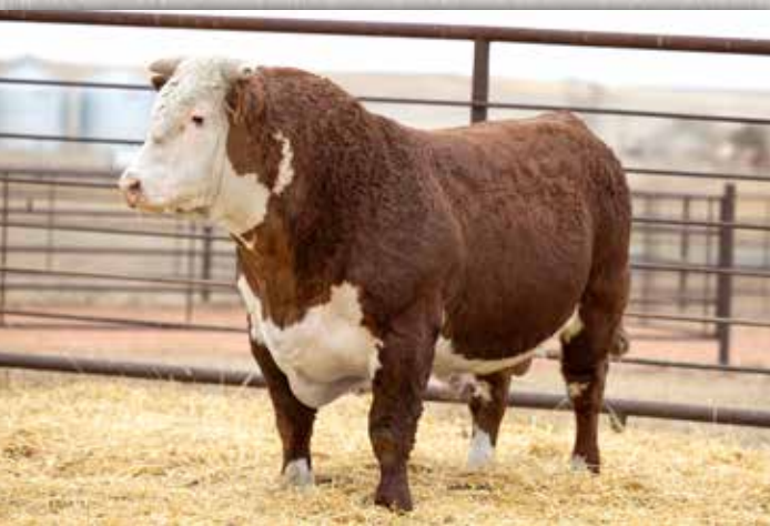
LOT 49 - MH 0052 QUINTER 3279L