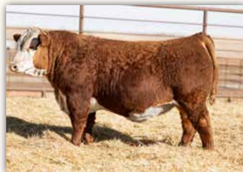
H 1136J BIG SHOT 3715L 1ET