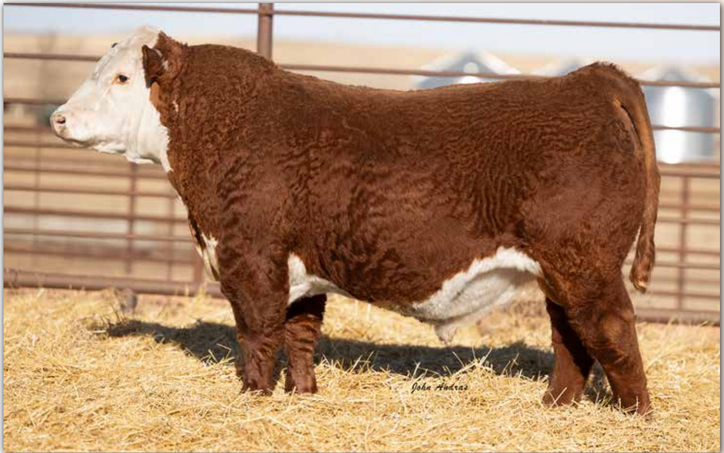
LOT 100 - MH 1136J BIG SHOT 3719L 1ET