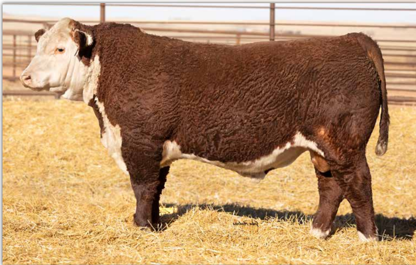
LOT 102 - MH 105H INNOVATION 3720L 1ET