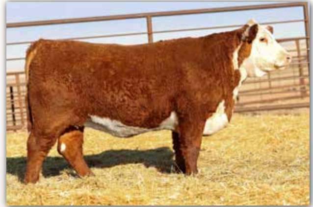
LOT 113 - MH MISS 0502 BRITISHER 375L