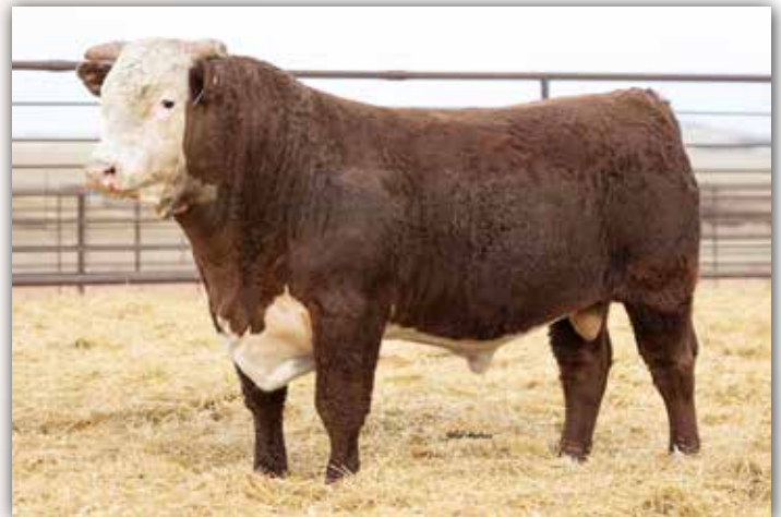
LOT 39 - MH 250 BEEFMAKER 3151L