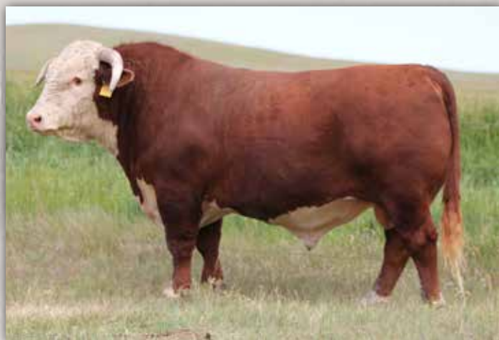
BCC COMET 711E

Comet 711 sons are long bodied, correct in their structure and have ample thickness and muscling. They are conservatively marked, and he adds pigment around their eyes. His mother is a Dam of Distinction. We are pleased with the results of 711 in our program and are excited about the continued future of this proven Herd Sire. Owned with Baumgarten Cattle Company at Belfield North Dakota. 18 sons and 2 bred heifers sell.