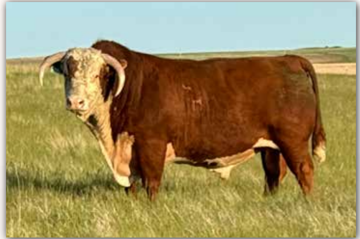
HH ADVANCE 1242J ET

1242 was our pick of the Holden Herefords 2022 Production Sale. Being out of a 12-year-old female that was still in production with an incredible udder and a proven production record this is the kind of outcross herd sire we desire being in the top 1% and 2% for UDDR and TEAT EPD's respectively. Longevity and maternal strength with eye appeal and mass. 5 sons sell.