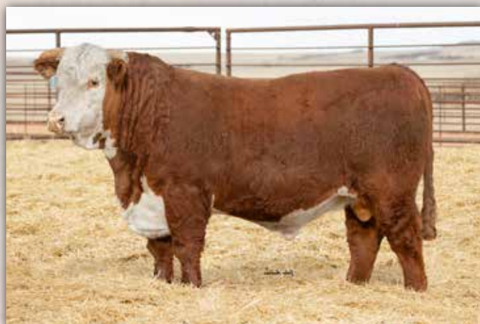
LOT 33 - MH 0209 COMET 3183L