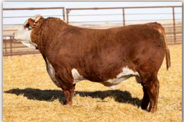
LOT 6 - MH FORWARD 3512L 1 ET