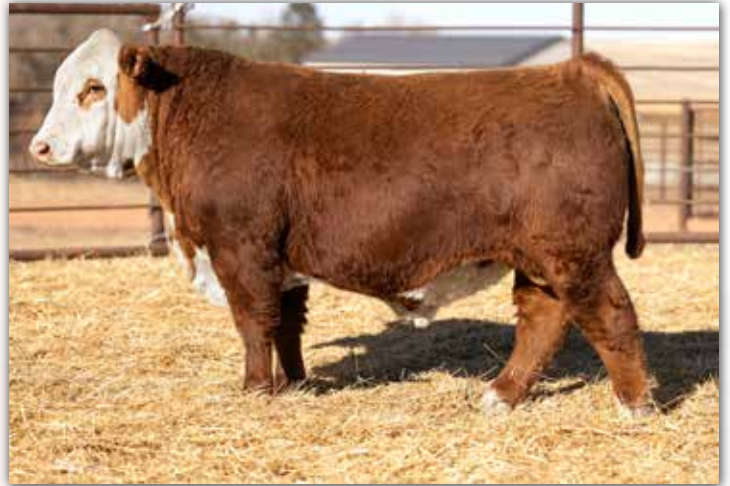
LOT 99 - MH 1136J BIG SHOT 3703L 1ET

MH 98 MH 1136J BIG SHOT 3701L 1ET (DLF, HYF, IEF, MSUDF) REG: P44570082 Calved: 9/9/23 Tattoo: 3701