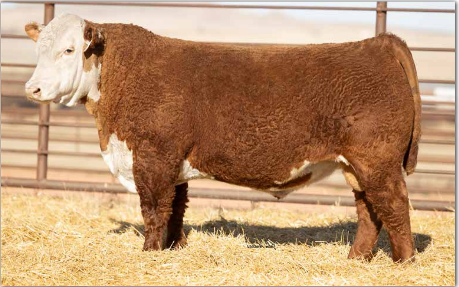
LOT 101 - MH 1136J BIG SHOT 3710L 1ET