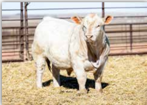
Full and half-brothers like him are available private treaty