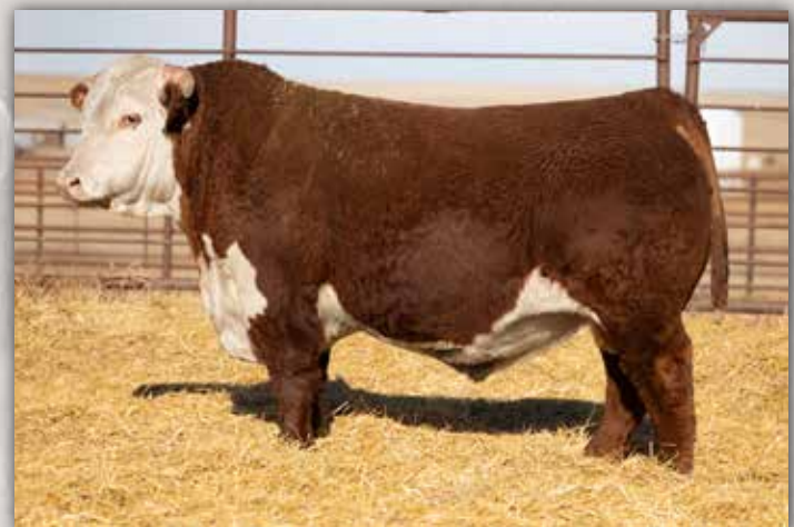
LOT 5 - MH FORWARD 3513L 1 ET