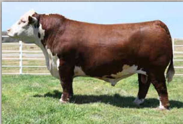
INNOVATION 105H - SIRE OF LOTS 103-107