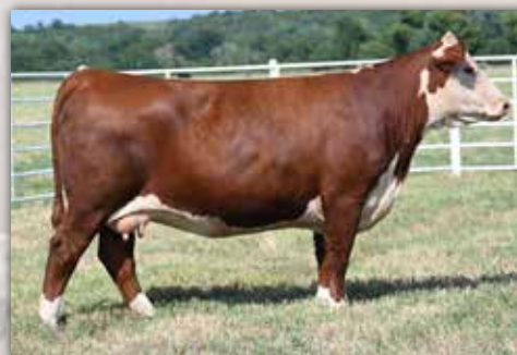
MS WORLD 515H DAM OF LOT 102

515H was the pick of the herd by Sadler Ranches from the Topp program. She has as much body and fleshing ability as any of the donors referenced in the fall division. Take note, her above picture was taken as a first calf heifer. She transmits this extra body, look, udder quality, as well as calving ease to her progeny.