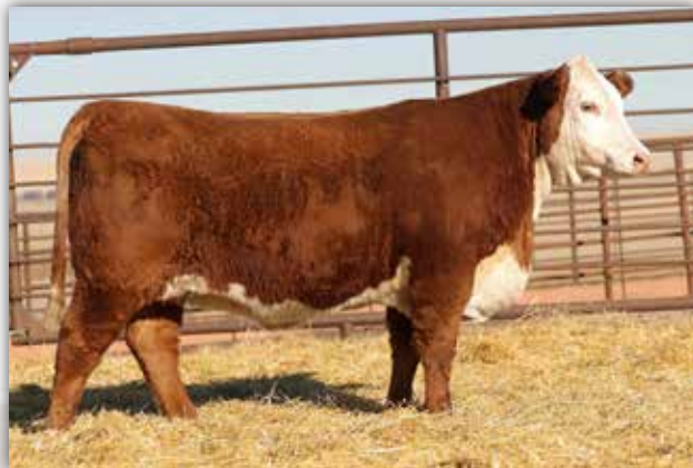
LOT 118 - MH MISS 1056 FORWARD 3135L