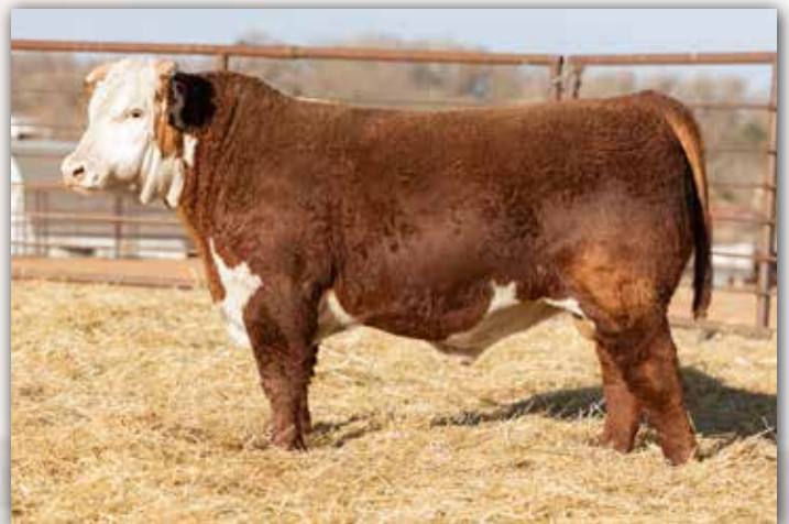
LOT 10 - MH TRAVIS 3560 1ET