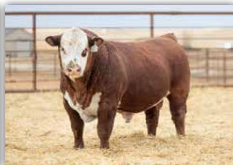
MH MAVERICK 3542L 1ET