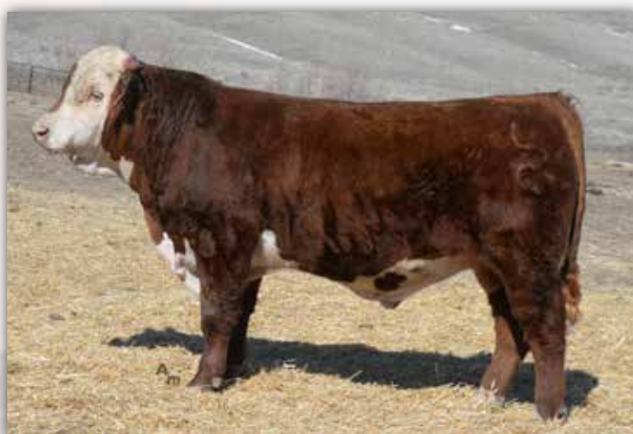
UU QUINTER 0052H