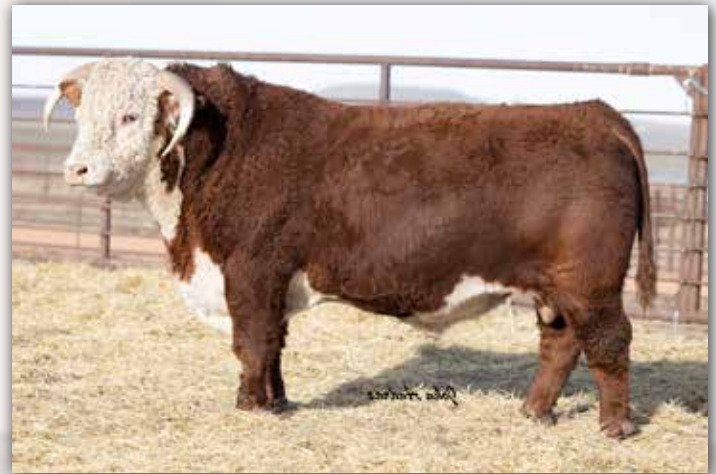
BCC DOMINATOR 814F

Dominator 814F has consistently driven performance into his calves while maintaining moderate birth weights. He is the son of one of the highest demanded sires in the Hereford breed, 619D. 824 is selected in our program to promote carcass qualities, femininity and performance. He ranks in the top 8% MM, 9% MARB, 10% CHB, 11% M&G, and 14% CW. 8 sons sell.