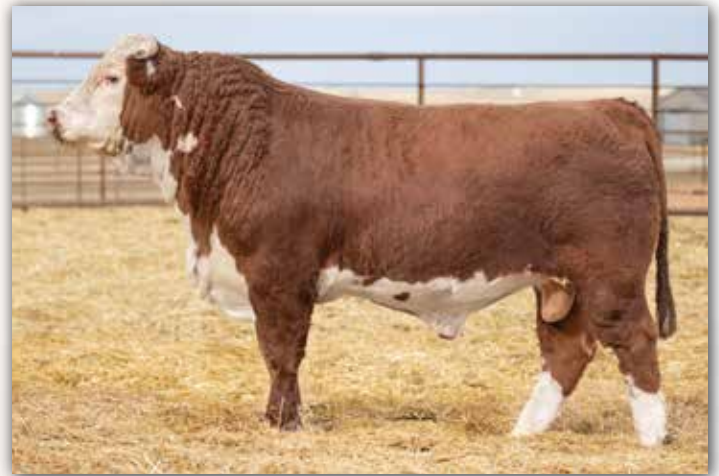
LOT 52 - MH 073 RED TIME 3158L