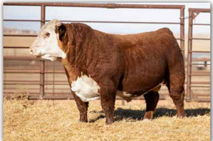
LOT 9 - MH 042 RED TIME 3510L 1ET