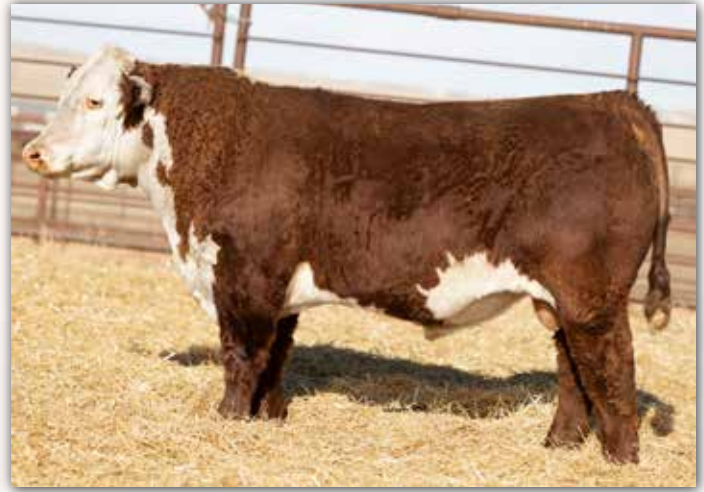
LOT 104 - MH 105H INNOVATION 3709L 1ET