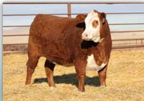
MH MISS 7491 DOMINO 3136L