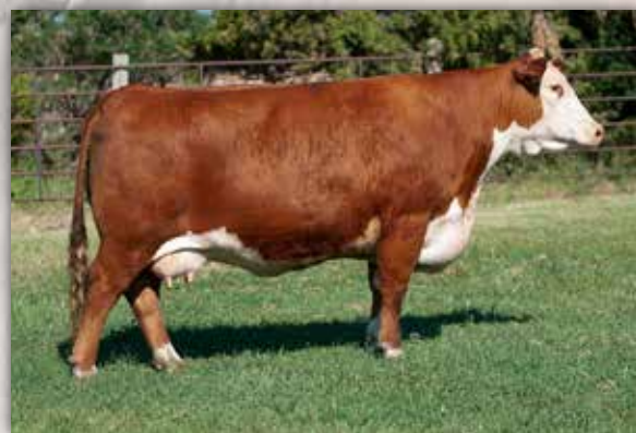
HH MISS ADVANCE 5031C ET PATERNAL GRANDDAM OF LOT 2

Videos available on our website mrnakherefords.com