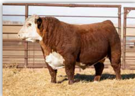
MH 042 RED TIME 3510L 1ET