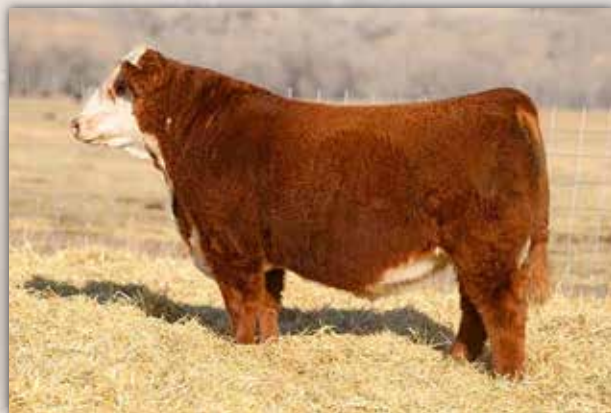
CHURCHILL BIG SHOT 1136J ET SIRE OF LOTS 96-101

Churchill Big Shot is a unique homozygous polled bull. He has a combination of body mass, fleshing ability and square hip in such an eye appealing package. Big Shot has plenty of bone, excellent pigment, is loose hided, and has a tremendous presence about him. Big shots dam was a favorite at the fall production sale for Churchill.