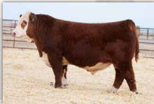
HH ILR FOWRARD 1056J - SIRE OF LOT 2