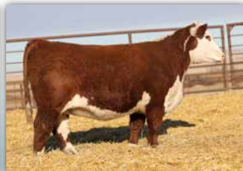
MH MISS MAKERS MARK 3524L 1 ET