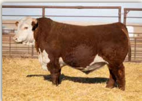
MH FORWARD 3513L 1 ET