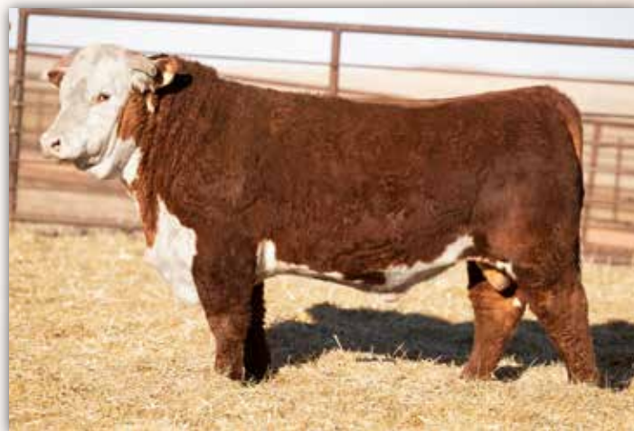
SON OF 17J - MH 17J NIGHTCAP 390L - SELLS AS LOT 21

Nightcap is a bull that does a lot of things right. He's proven to be a very good breeding bull that is covering all the bases with plenty of rib, bone, and the big foot we like to see in our cattle. Trait leader for WW, YW, SC, M&G, CW, MARB, and $CHB. 4 sons sell and 1 bred heifer sell.