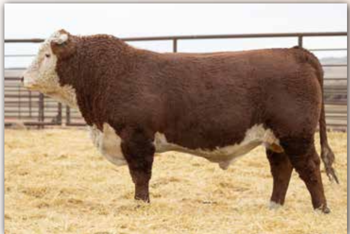
LOT 27 - MH 1242 ADVANCE 3146L