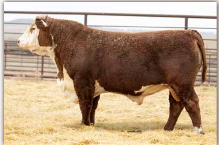
LOT 71 - MH 0052 QUINTER 3293L