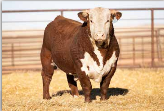
LOT 23 - MH 0052 QUINTER 3134L