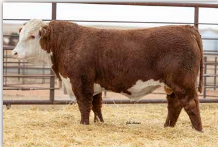
LOT 44 - MH 599 SUSTAIN 3256L