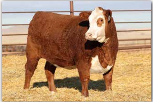
LOT 119 - MH MISS 7491 DOMINO 3136L

• 3136 combines some of the best maternal genetics in the offering. Her maternal grandsire has some of the best females gracing our pastures today. Goggle eyed and red to the ground this female is huge volumed and sure to make friends on sale day.