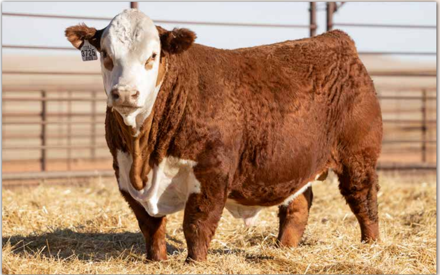
LOT 97 - MH 1136J BIG SHOT 3725L 1ET

MH 97 MH 1136J BIG SHOT 3725L 1ET (DLF,HYE,IEF,MSUDF) REG:P44585856 Calved: 10/1/23 Tattoo: 3725