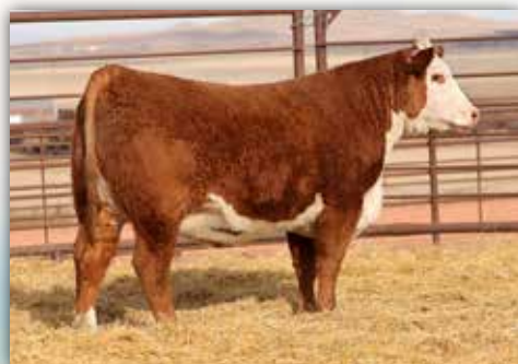
MH MISS 1056 FORWARD 388L