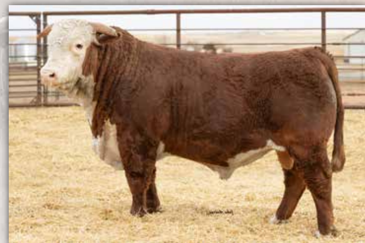
LOT 29 - MH 250 BEEFMAKER 3247L

Videos available on our website mrnakherefords.com