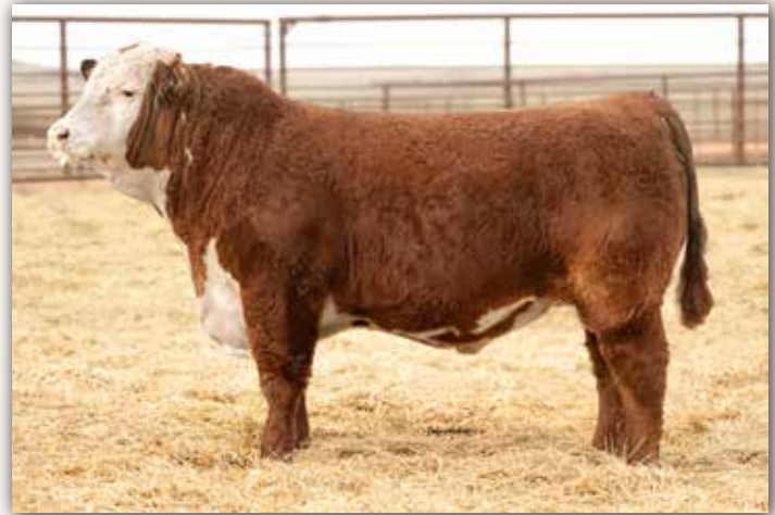
LOT 54 - MH 718 DOMINATOR 3237L