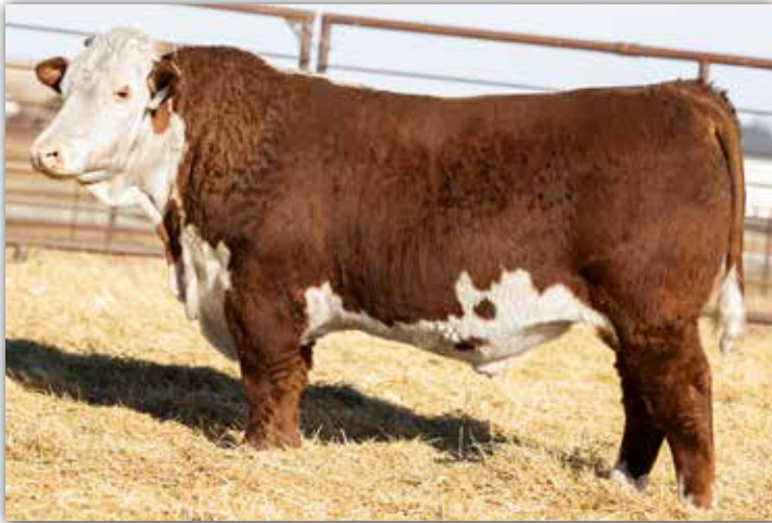
LOT 105 - MH 105H INNOVATION 3714L 1ET

MH 105 MH 105H INNOVATION 3714L 1ET {DLF,HYF,IEF,MSUDF} REG:P44570115 Calved: 9/21/23 Tattoo: 3714