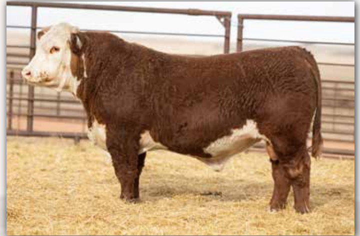
LOT 53 - MH 711 COMET 3259L