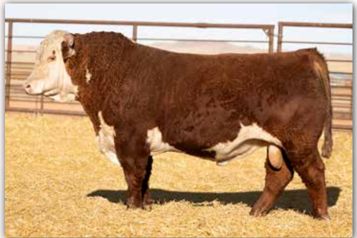
LOT 24 - MH 17J NIGHTCAP 335L