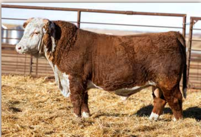
LOT 46 - MH 711 COMET 3177L