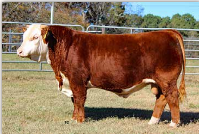
WHR 290E B901 BEEFMAKER 250GET

The Beefmaker sire group will certainly catch your eye in this year's sale. 250G is a proven herd sire that adds performance and carcass to every calf. While judging the National Pen Show in Oklahoma City, this bull walked into the ring and I knew we had to own him. He leads the Hereford breed in 10 traits and has as much style, power and eye-appeal as any bull walking. His offspring are direct replicas of what we hoped he would produce and his genetics are certain to work in any program in the country. Owned with Stuber Herefords, ND. 4 sons sell.