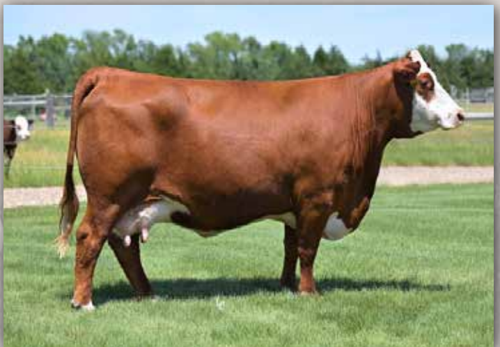
CSC 701 LADY DEW 004

004 comes from CSC Livestock in Sundance, WY. She is an extremely maternally bred female with some of the most notable females in the breed in her pedigree. We also recognize and appreciate the need for additional pigment in the breed and 004 definitely excels in being heavily pigmented and short marked. We are looking forward to her progeny hitting the ground this spring sired by Stanfield, Levitate, and High Noon.