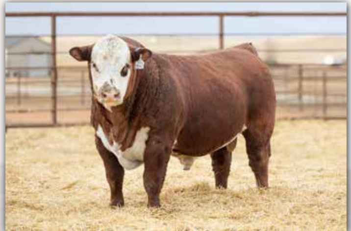
LOT 60 - MH MAVERICK 3542L 1ET