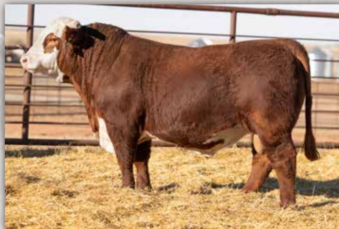
LOT 20 - MH 073 RED TIME 350L