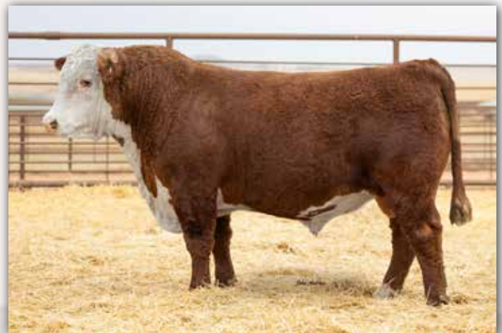
LOT 40 - MH 1242 ADVANCE 336L