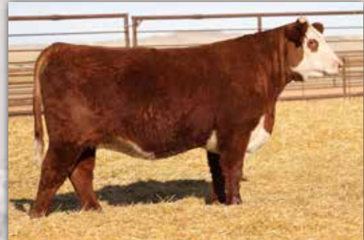
LOT 111 - MH MISS 211 VAULTED 308L