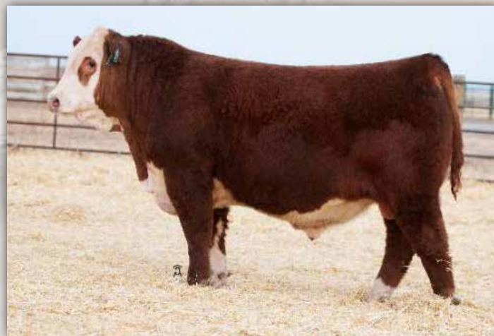
HH ILR FORWARD 1056J ET