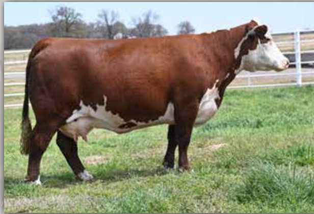
EDEN 321E DAM OF LOTS 108 AND 109