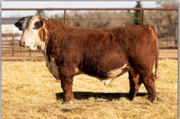
LOT 14 - MH 711 COMET 3226L