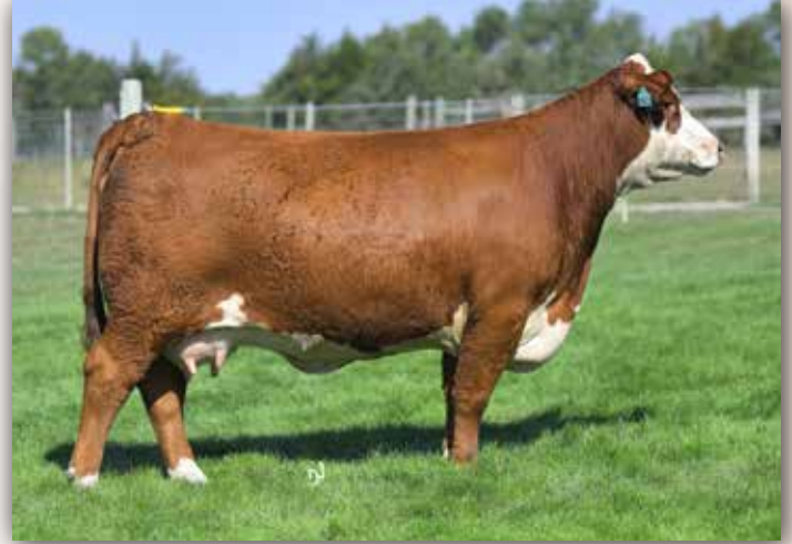
HH ILR MISS FORWARD 1144J ET

We had the opportunity to acquire not only 1144J from Iron Lake Ranch and Holden Herefords but her full brother Forward 1056J. When we studied the maternal performance and the pedigree we knew this female was special. She intrigued so much that we partnered on her full brother Forward 1056J as well with Pelton Herefords. The proven horned and polled pedigrees of this mating along with the extremely strong maternal characteristics coupled with the volume, rib shape, and muscle that both of these possess, and 1144J's flawless udder made this an easy decision. These genetics will have a big impact in our program for years to come. Her first natural calf sells as lot 27.