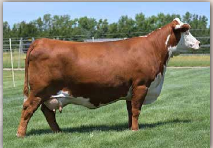
MH MISS HOMETOWN 6476

6476 has found her way to the donor pen the old-fashioned way- through proof of production over 8 years with her 2023 bull calf as lot 1 of this sale. She is a perfectly balanced female who is correct in her design, big footed, excellent hoof structure, big ribbed, stout hiped, wide pinned, and her udder quality is impeccable. Not always do the EPD profiles translate into the real world, however, in 6476's case in does. She is a trait leader in CE, and low BW, not mention has curve bending EPD's for a 9-year-old cow in maternal excellence. We are looking forward to getting her Stanfield, Forward 1056J, and High Noon progeny on the ground this spring. Son sells as lot 1.