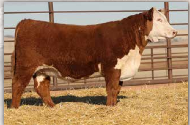
LOT 117 - MH MISS BELLE AIR 3501L 1ET