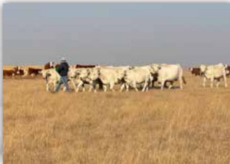
Docility is crucial no matter what breed they are!