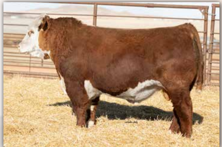
LOT 7 - MH 1056 FORWARD 3549L 1ET