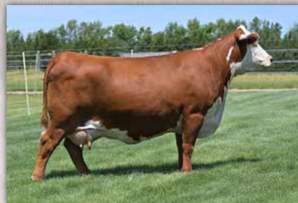
MH MISS HOMETOWN 6476 - DAM OF LOT 1