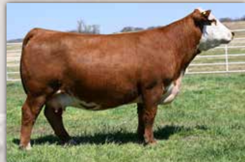
HH MISS ADVANCE 0108H DAM OF LOTS 96-99

0108H is an elite, powerful female who is as stout of a L1 cow as you will find. Her dam is still in production at 12 years of age. She is backed by 6 generations of heavy muscled power donors with excellent udder quality.