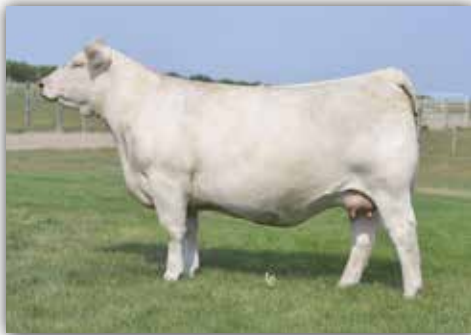
"CECE" CAG GARW FIREFLY 9637G

As in the Hereford breed, we believe great bulls are backed by great cows. We believe we have some of the best cows in the Charolais breed producing some great Charolais bulls. Either before or after the sale we invite you to stop by the ranch to view these great females and the sons they produced for our Private-Treaty Charolais bull offering.