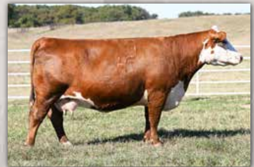
HH MISS ADVANCE 4123B DAM OF LOTS 100 AND 101

Sold as a yearling heifer 4123B goes back to one of Jack Holden's favorite cows 1028L. 4123B possess excellent udder quality, is very stout, and is backed by generations of Holden donors.