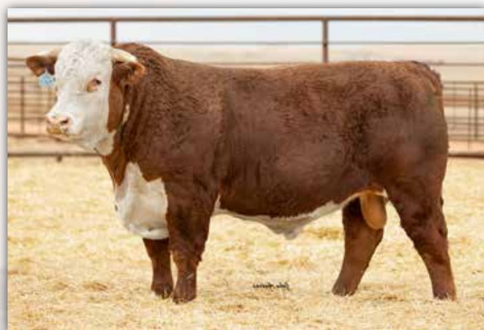
LOT 31 - MH 073 RED TIME 385L