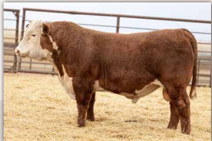
LOT 28 - MH 1242 ADVANCE 3347L