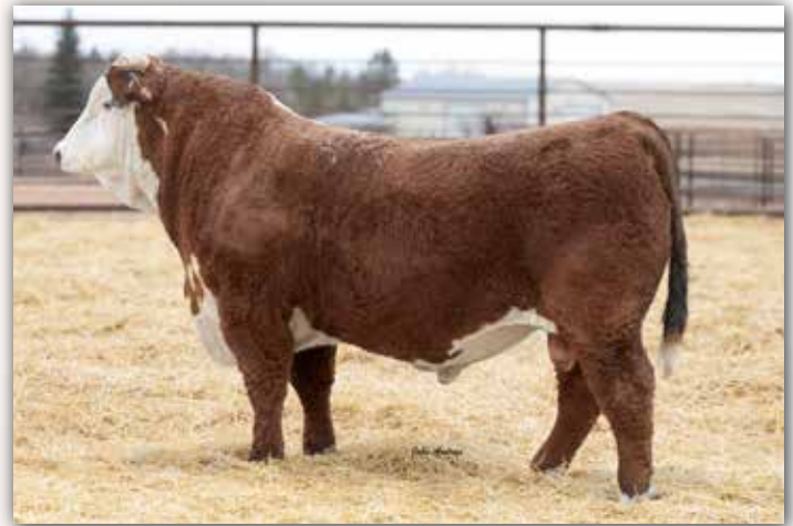
LOT 59 - MH 038 ADVANCE 3224L