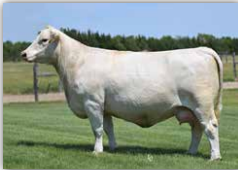
HC HONEY VORTEK 9002 PLD