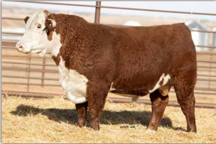
LOT 103 - MH 105H INNOVATION 3713L 1ET