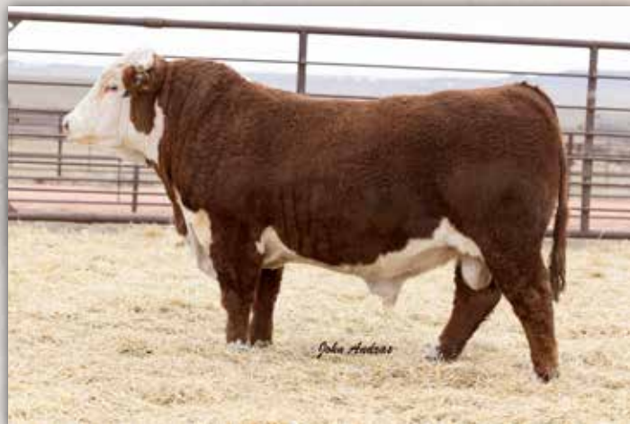
MH 708 RED TIME 042

042 was the high selling bull in our 2022 sale going to CK Cattle of SD. This bull combines the ruggedness, length of body, and muscle shape of 708 and is backed by our cornerstone donor 551. 042 is an extremely attractive bull who is correct in his design, well balanced, big volumed, and has a massive hip. When you combine these attributes with the impeccable maternal strength in his pedigree you get a true breeding bull which we believe his progeny will possess as well. 2 sons sell.