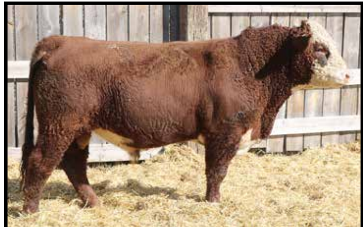
B TRAILRIDGE OPEN 76L

• Goggled eye polled bull – His top is as wide as anybody and there isn't a hole in him. I can't imagine how easy sale day would be if they all looked like him. The bull just missed gaining 400 pounds on test so I am really puzzled on his YI data. He should be named extra, extra pigment, extra muscle. Outcross polled pedigree of the sale.