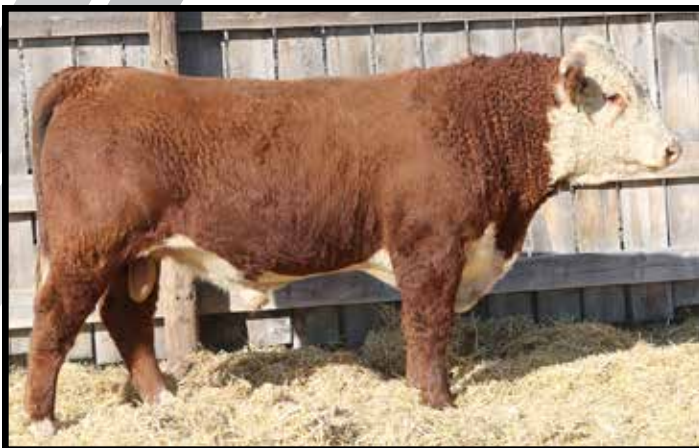
B 1235 DOMINO 40L