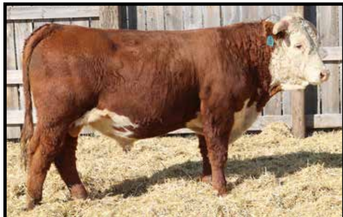
B 1235 DOMINO 36L

• He has great performance ratios and comes with a high maternal recommendation. The power in him comes from the extra stretch and a big hip. Negative RFI and an ADG of 4.28. The calves will perform and female side will add value. 1235 sire group is very strong this way.