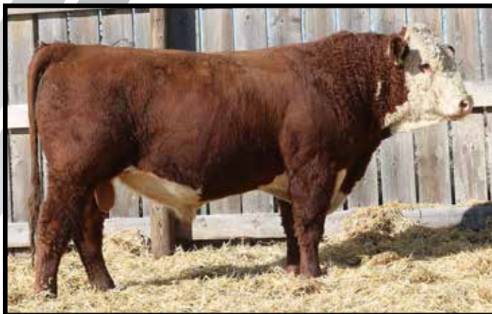
B KINGDOM 70L