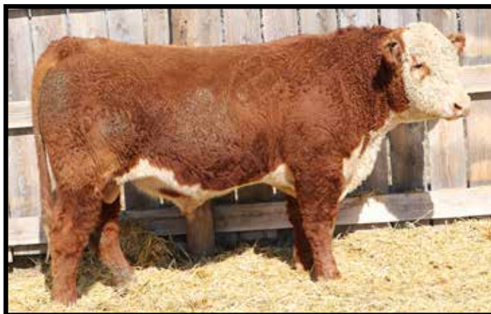
B BIG VALLEY 123L