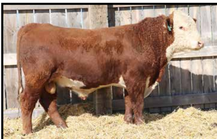
B KINGDOM 73L

• Dam 155 has exceeded expectations and waiting for that great heifer did not come. Raised on her at twelve there is a lot of untapped potential and I would expect him to sire a calf crop with straight lines neat pattern and the muscle roughneck can bring.