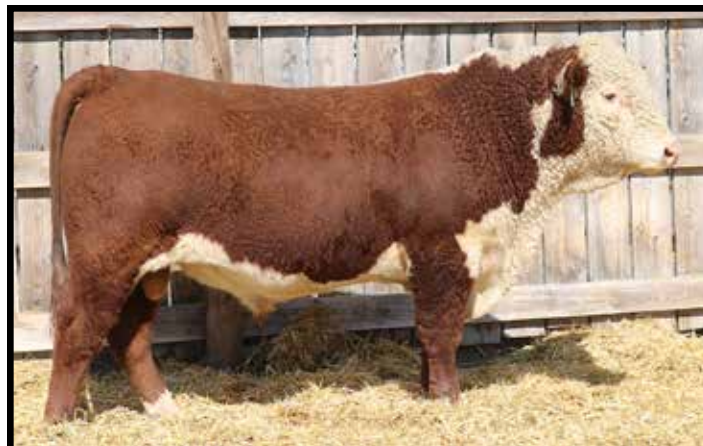
B SET ANCHOR 48L

• Every year I try to figure out what to breed this cow to and on calves 5 and 6, she's finally produced the bulls I'm looking for – big hip, square in the corners, a little extra frame – and a huge plus for anyone trying to market more pounds. He is awesome.