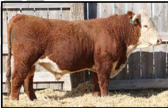
B BIG DOMINO 11L