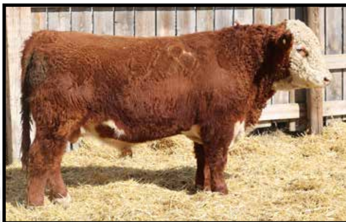
B BIG VALLEY 124L