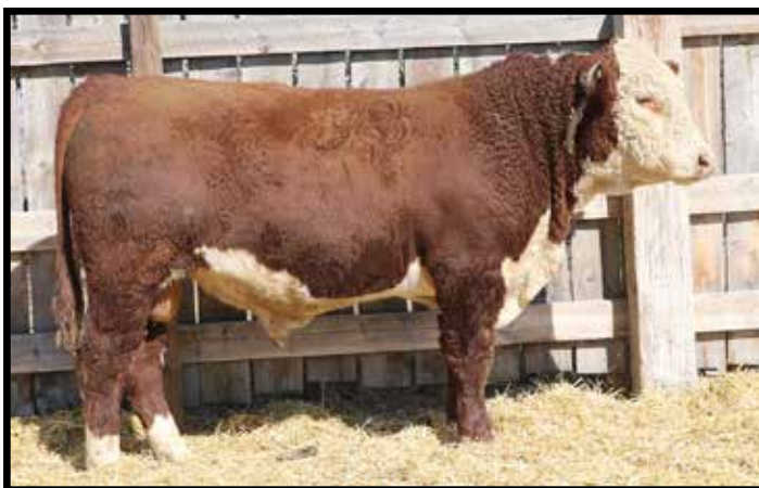
B GALLATIN 32L