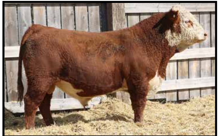
B IDEAL 27L

• Goggled eye bull that gets this year fire plug award. So stout, so deep, there is no reason not to love him. He will help your marbling scores and has a negative RFI. He is easy to find and has everything but extra frame, but I still like him. Dam has a very refined correct udder.