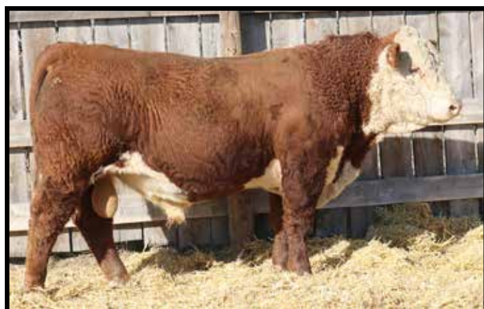
B KINGDOM 61L