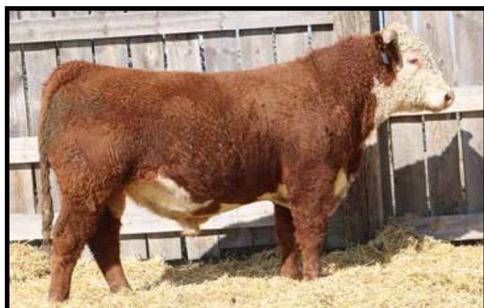
B IDEAL 90L

• His dam has the most pigment of any Long Haul daughter we own and she is extreme in her femininity. That is hard to believe when you look and see just how rugged and massive this prospect is.