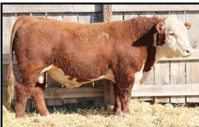
B KINGDOM 42L

• He is beefy. He is powerful, extra timber under him, stands wide and gives extra dimension in every direction. We calved a full sister this spring and she is highly desirable, a neat smaller framed power cow. Tremendous performance numbers with breed average birth weights.