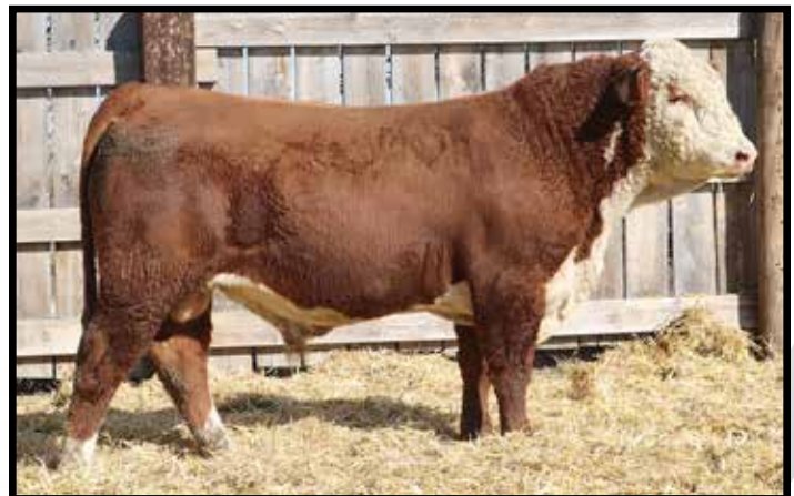
B BIG VALLEY 28L

• I am not sure anyone can out produce his mother. She is beefy with extra bone. Her first son sold top three, a full sister with a neat udder calved this year, and now 28. His weaning and yearling indexes are clearly elite. I would try as hard as you can to get him bought, he will be worth it. He has incredible extension.